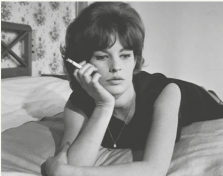
Una ragazza inquieta, Bolero Film, 1962

Special opening Wednesday April 25 10 am – 8 pm Thursday April 26 10 am – 8 pm Monday April 30 10 am – 8 pm Tuesday May 1 10 am – 8 pm Saturday, May 19 (Museums’ Night) open until midnight