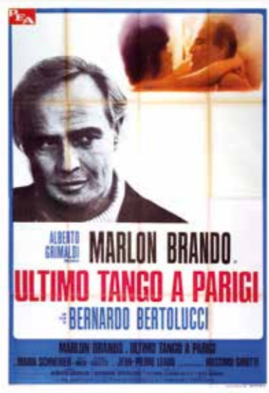
B. Bertolucci, Ultimo tango a Parigi, 1972