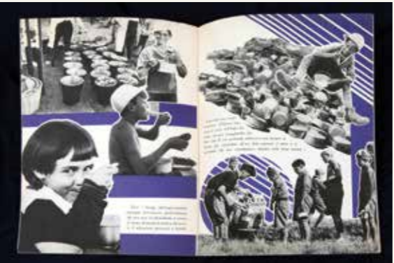
Campi e colonie estivi in patria dei figli dei lavoratori italiani residenti all'estero, 1931 - Istituto Geografico De Agostini, Novara

A photobooks selection regarding those revolutions, protests and social and religious utopias that characterized the last century. The exhibition presents volumes produced by totalitarian regimes, propaganda books supported by a revolutionary graphic and iconographic energy for the society of that time. Moreover the most significant photobooks regarding those revolutions like African ones, protests, 1930s magazines and the Iranian photobooks. Extraordinary and lost gems of graphics and images representing ideas, projects and utopian ideals recover from the past.