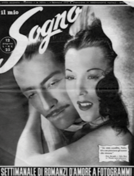
Copertina de Il mio sogno, 1947

the-scenes shots by Federico Vender. The social and political uses of the photonovel are explored as communication tool, reaching up to creating a new project for a contemporary fotoromanzo by use of social networks. Nessuna colpa, this is the title of the new production, is inspired by a story for a photonovel written in 1961 by Cesare Zavattini and adapted through a series of episodes set in present day, created on Instagram, where they are to be released on a daily basis for a whole month. Screenplay by Matteo Casali, photographs by three young authors from the Emilia-Romagna region: Nicolò Maltoni, Valentina Cafarotti and Federico Landi.